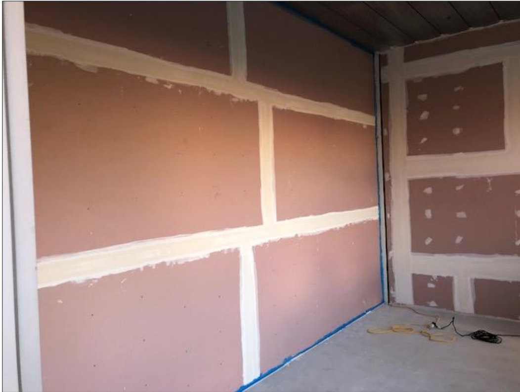
Figure 4: Wall panel system test sample