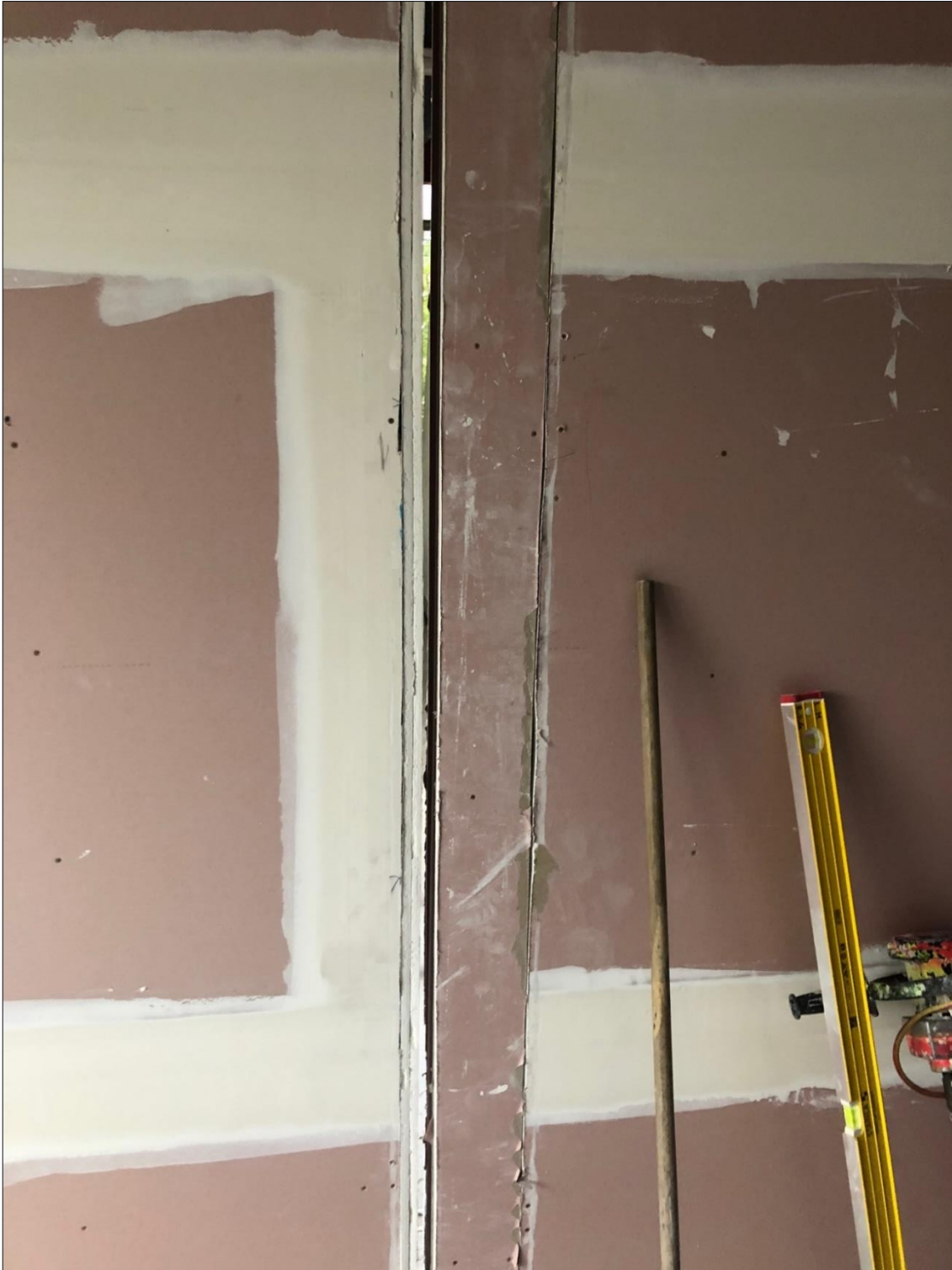
Figure 2: Structural break in bounding wall

Access doors to each end of the space have been located diametrically opposite and include raised thresholds to limit sound leakage.