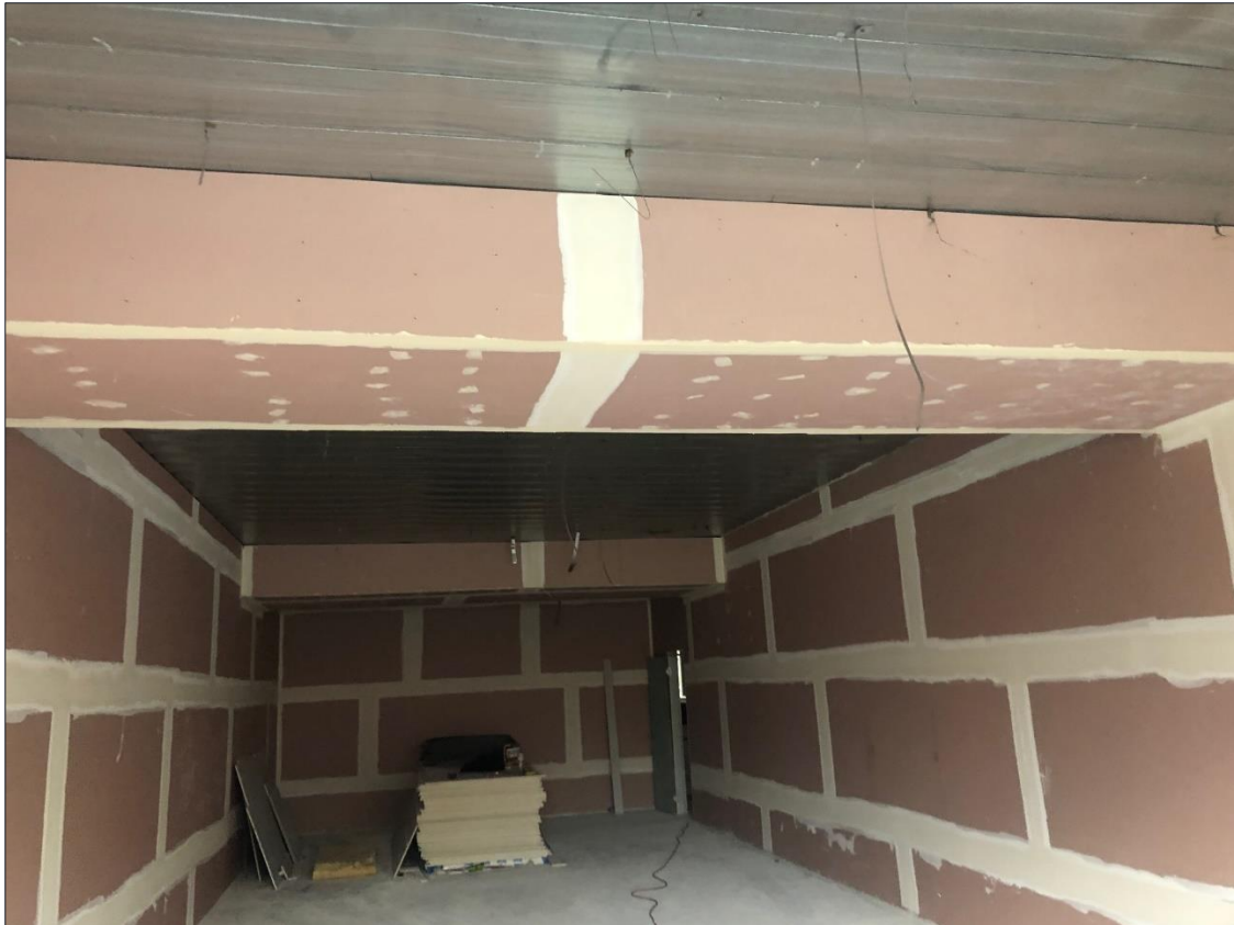
Figure 1: Bounding walls

The test sample is to be mounted at a dedicated location to divide space into two separate rooms. The sample location includes a structural break to limit sound flanking via the bounding walls. The structural break is shown in Figure 2. The break has subsequently been packed with rubber.