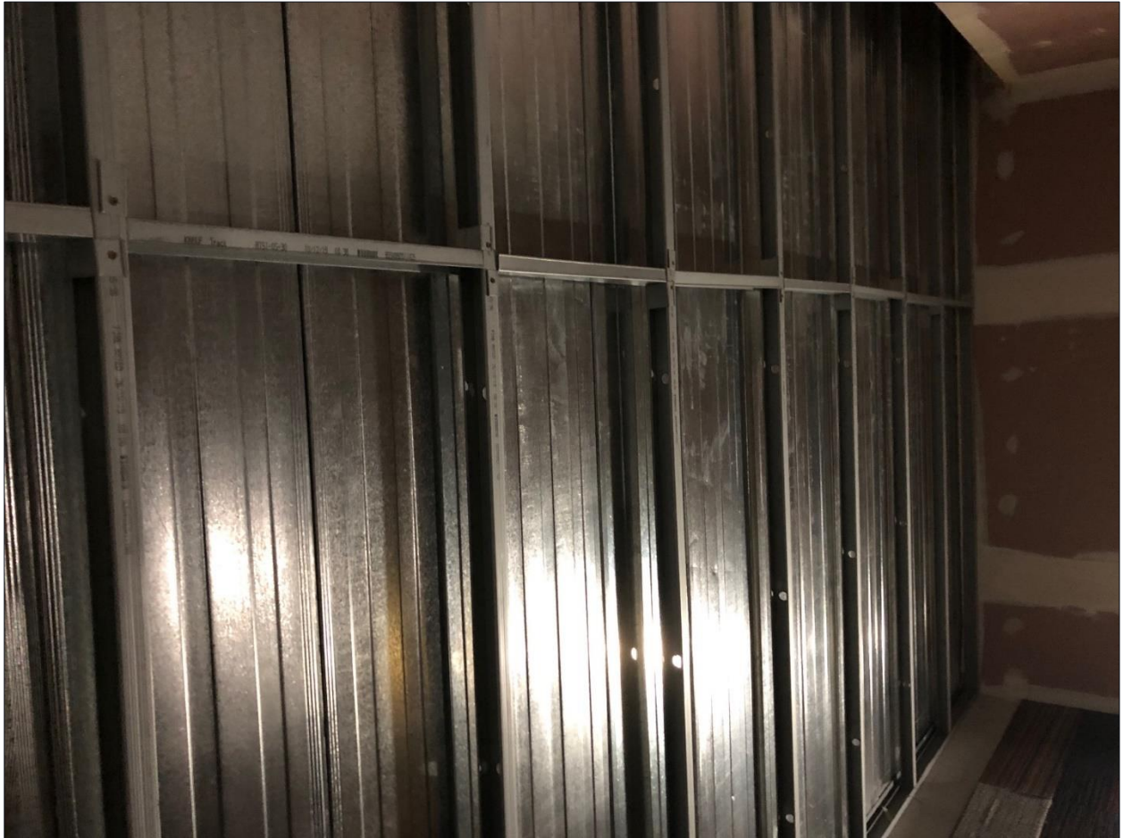
Figure 4: Separate stud arrangement